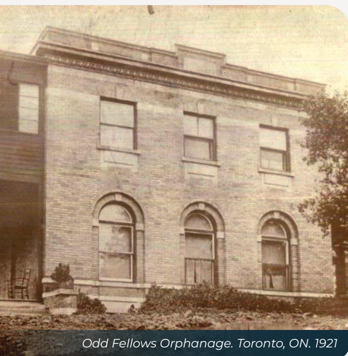
Odd Fellows Orphanage. Toronto, ON. 1921

To honour the historical contribution of the Independent Order of Odd Fellows, the Home still bears the Odd Fellows name, and the present corporation is still known as the IOOF Seniors Homes Inc.