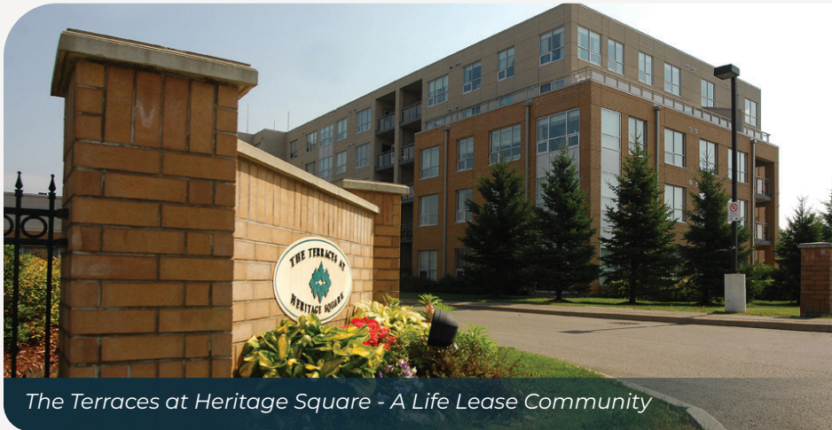
The Terraces at Heritage Square - A Life Lease Community

The IOOF provides continuity of care across multiple facilities that serve our community, and offer independent living, supportive housing, convalescent care, and long-term care options to our residents and their families.