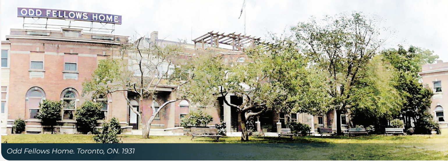
Odd Fellows Home. Toronto, ON. 1931

Established in Barrie in 1940, the IOOF Seniors Homes Inc. is respected in the community as a charitable not-for-profit organization, offering a continuum of services which includes long-term care, convalescent care, assisted living, affordable rental apartments, and independently owned life-leased apartments.