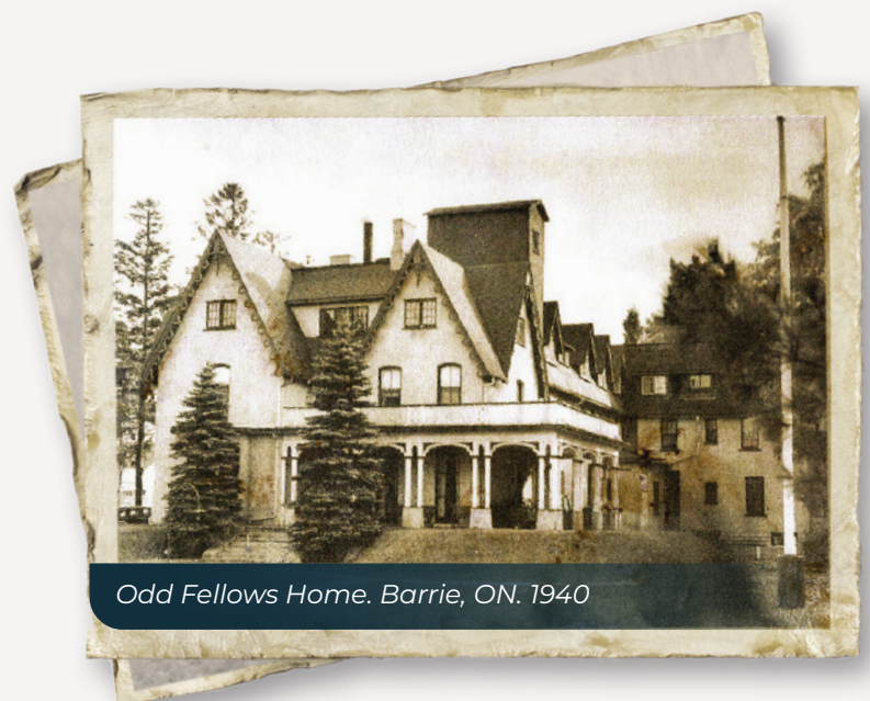
Odd Fellows Home. Barrie, ON. 1940