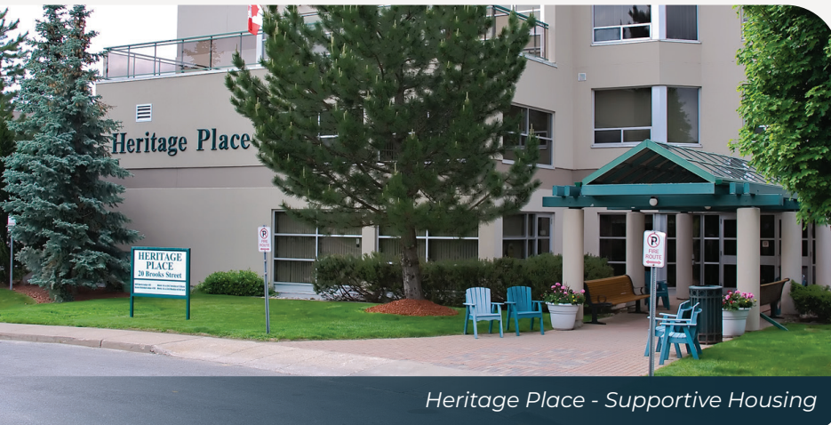
Heritage Place - Supportive Housing