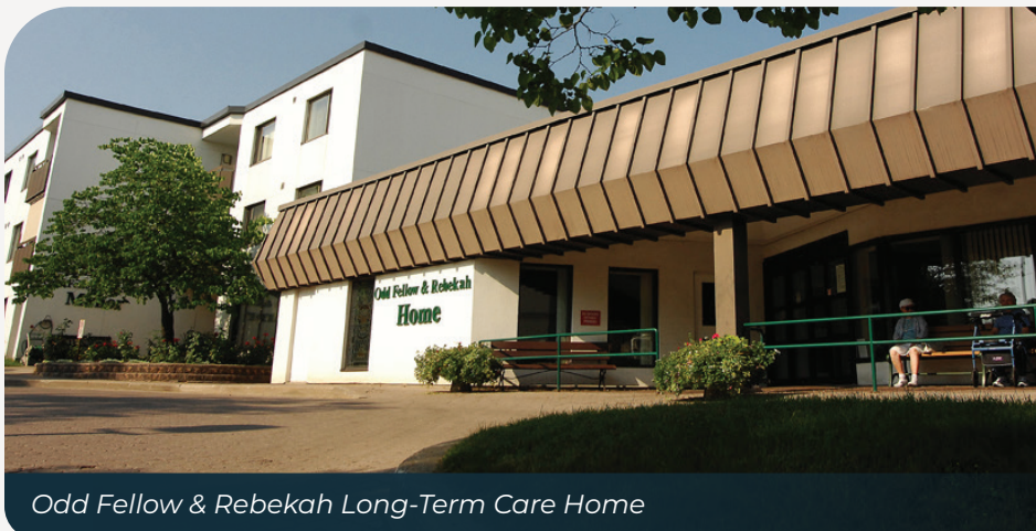
Odd Fellow & Rebekah Long-Term Care Home