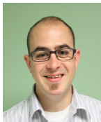
Travis Durham Support Services