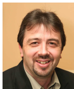
Elvis Pohl Property Management