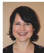
Gaja Damas Program Support